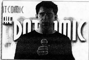
Nibblebox's "DotComic"; (top of page) "Muffin Films."